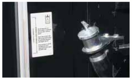
Quickly inspect hydraulic and transmission oil levels using site gauges.

Forward/reverse shuttling is easy. To shift to first reverse when in gears one through eight all you do is move the shuttle control on the left side of the steering column. The inching pedal allows you to maneuver in tight quarters and is especially helpful when hooking up implements.